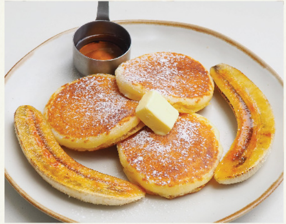
Pancakes & Banana · 280 B 🌿

Homemade buttermilk pancakes, streaky bacon, premium butter & maple syrup