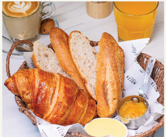
Continental Breakfast • 270 B

Homemade English muffin, poached organic eggs served with Paris Ham or smoked salmon, Hollandaise sauce, cherry tomatoes & green salad