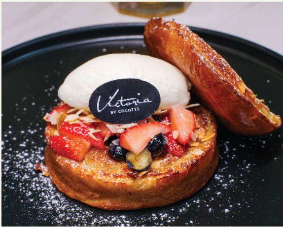
Bostock · 260 B 🌿

Homemade buttermilk pancakes, caramelized banana, premium butter & maple syrup