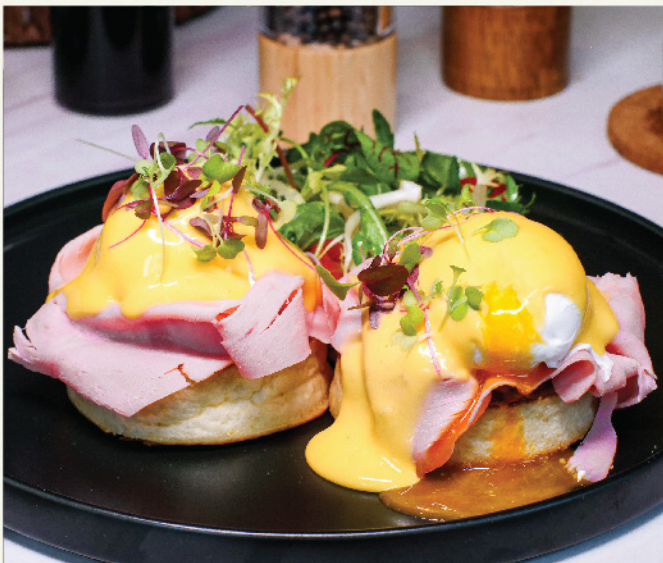
Eggs Benedict Ham • 310 B / Salmon • 340 B

Choose your style of eggs: Scrambled, Poached, Fried, Omelette or Sunny Side Up