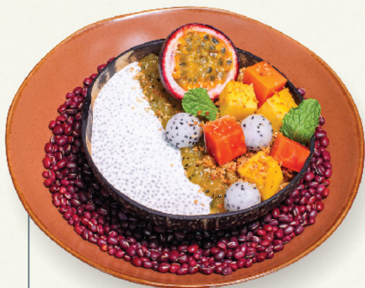
Tropical Chia Pudding · 280 B 🌿

Coconut chia pudding with mango smoothie base, topped with homemade granola, mandarin-mango jam & freshly cut tropical fruits