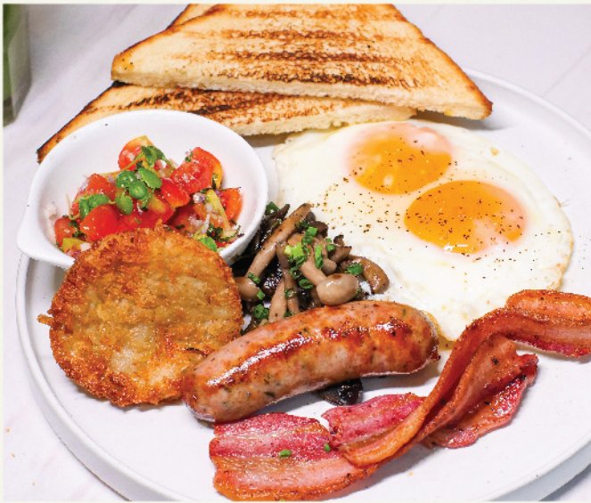
Victoria Breakfast Bacon & Sausage • 440 B

2 eggs of your choice, sautéed mushrooms, bacon, sausage, Homemade hash brown, toast, cherry tomato salsa