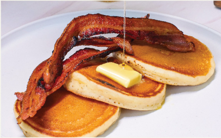
Pancakes & Bacon · 320 B 🐷

Homemade buttermilk pancakes, streaky bacon, premium butter & maple syrup