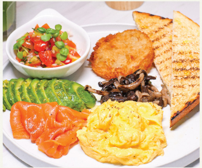
Victoria Breakfast Avocado & Salmon • 440 B

2 eggs of your choice, sautéed mushrooms, bacon, sausage, Homemade hash brown, toast, cherry tomato salsa