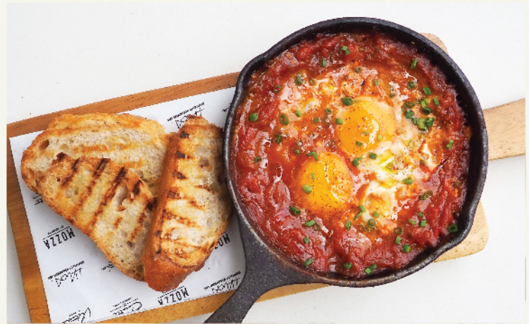
Shakshuka · 290 B 🌿

Homemade brioche filled with almond paste soaked in Bostock syrup, topped with homemade honey ice cream, fresh fruits & berries